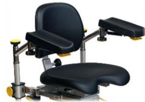
140-00247-02 black art leather

Vinyl has an airy, ventilated, slick texture good for long sessions