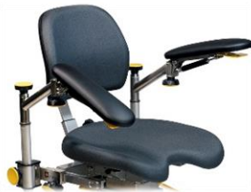
140-00118-02 black vinyl