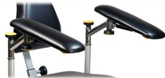
140-00323-01 Cushion soft & rectangular