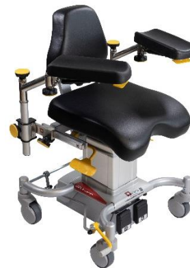
Carl 4 Heel

Electrical chair Mechanical brake Optional armrests