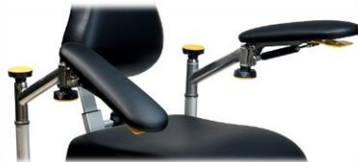
140-00323-00 Cushion soft & convex