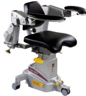
Carl Mk2 R8

Electrical chair Electrical brake Optional armrests