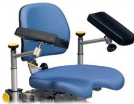
140-00118-00 blue vinyl