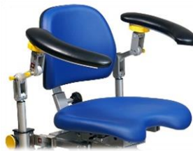
140-00247-00 blue art leather