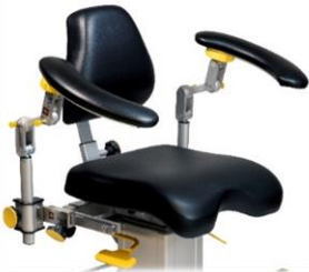
140-00306-02 cushion kit soft padding Suitable for longer surgeries, thick padding on both back and seat