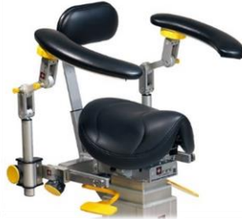
140-00321-02 Saddle seat Amazone When seated higher up. Possible to have small or big backcushion