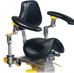
140-00322-02 Saddle seat Jupmer Wider with thicker padding. Possible to have small or big backcushion