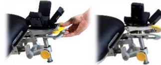
140-00270-08 Luigi headrest with pillows, for One grip headrest With multiple replaceable cushions in different thickness/firmness