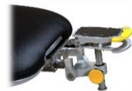
140-00270-07 Headrest One grip Tiltable headrest with seamless adjustment in angle, lateral tilt. With a quicklock to change between different headrests