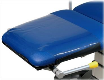
140-00251-00 Leg cushion cover R6 R7

Twice the number of operating cycles and half the weight of the standard, and a longer lifespan