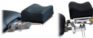
140-00270-04 Pillow for S-tray Soft memory foam, good for when the head is tilted to the side