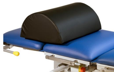
140-00265-01 Leg support half circular

Increased comfort for patients if their knees must come up higher