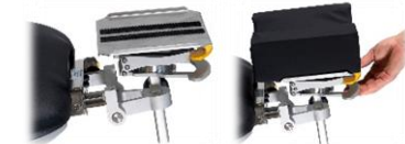
140-00270-09 S-tray, for onegrip Small tray for various pillows. The pillows are attached with velcro