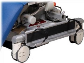
140-00351-00 Bracket for oxygen tank

Protects against dirt from shoes. Extends the lifespan of the leg cushion