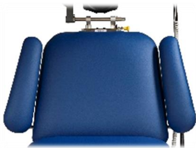
140-00350-01 Width extension back rest left