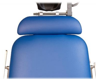
140-00232-00 Length extension back rest

Improves patient comfort and supports their arms to be on the operating table and gives a more secure feeling