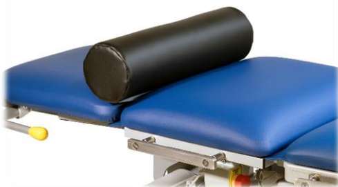
140-00265-00 Leg support circular

Length extension increases comfort for taller patients