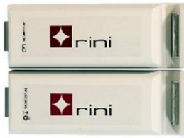
140-00237-02 Battery lead (Standard)